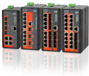
Industrial GbE Managed Switch IGS-1604SM & IGS-812SM & IGS-803SM & IGS-404SM