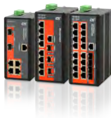
Industrial FE Managed Switch IFS-1604GSM & IFS-803GSM & IFS-402GSM